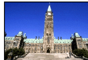
The Parliament Building in Ottawa, Ontario. Chapter Connections Day and Dynamics 2005 was held in our Nation's Capital.